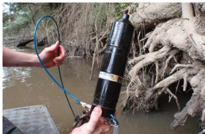
Figure 2 – Setting up an acoustic listening station.