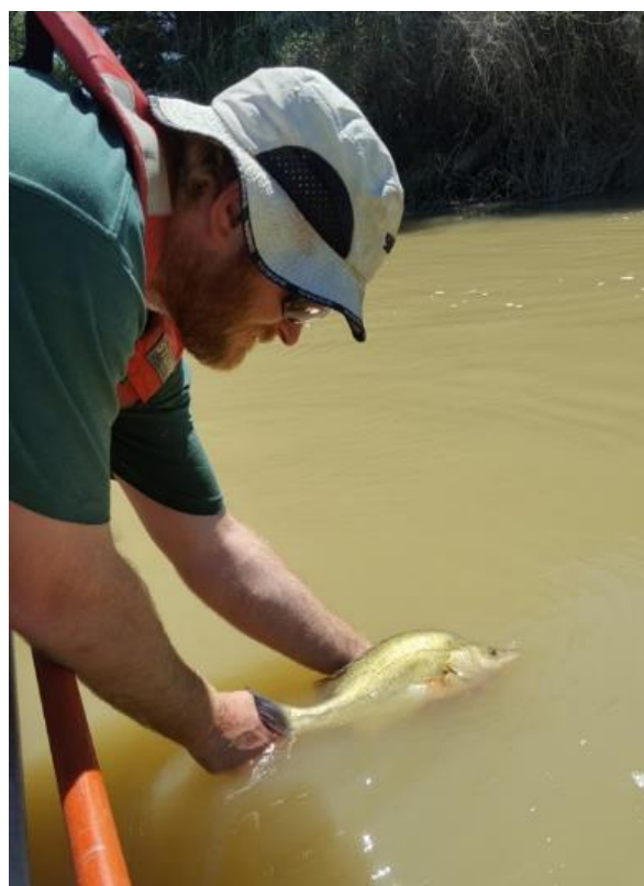
Figure 5 - Release of an acoustically tagged Golden Perch into Pyramid Creek.

Justin.O'Connor@delwp.vic.gov.au (Dispersal)