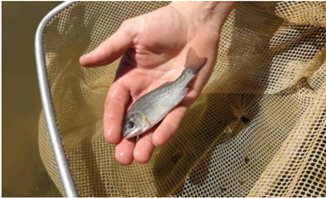
Figure 3 – A tagged juvenile Silver Perch being released in the Murray River.