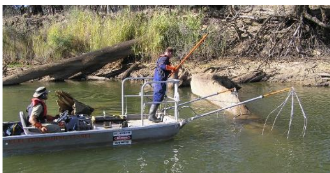
Figure 1 – Boat electrofishing is one of the survey techniques used in VEFMAP.

All fish were identified to species, counted, weighed and measured. Fish >250mm TL were externally tagged with a T-bar or Dart tag. Samples of Golden Perch, Silver Perch Bidyanus bidyanus and Murray Cod Maccullochella peelii were also collected for aging to contribute to the generation of system specific growth models.