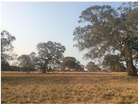
Figure 3. Scattered trees in farmland have a strong positive influence on the number of woodland bird species in farm landscapes.