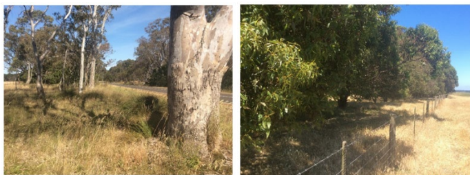
Figure 1. Remnant native vegetation (left) along a roadside; and revegetation planting (right) in the form of a shelterbelt.

Landscapes were also selected so that some included scattered paddock trees, and some did not.