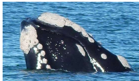
Figure 3: Southern Right Whale spyhopping.