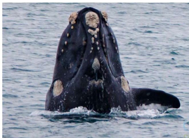
Figure 2: Southern Right Whale Breaching. Callosity patterns on the rostrum clearly visible.