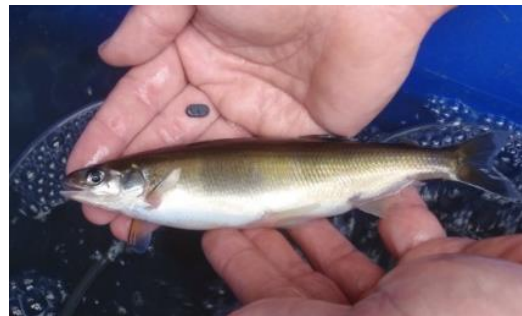
An Australian Grayling with an acoustic transmitter

Frank.Amtstaetter@delwp.vic.gov.au (Monitoring in the Thomson and Tarwin rivers)