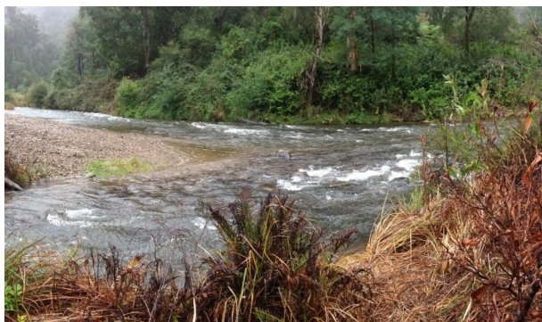
The Thomson River during a release of environmental water

In Victoria, many agencies work to implement environmental watering programs. West Gippsland Catchment Management Authority and Melbourne Water have developed seasonal watering proposals which include key flow objectives to deliver within channel flow pulses, known as 'freshes', to specifically trigger downstream migration and spawning of Australian Grayling. Every June, the Victorian Environmental Water Holder collates and summarises these seasonal watering proposals into a seasonal watering plan which previews all potential environmental watering across Victoria for the coming water year under each planning scenario.