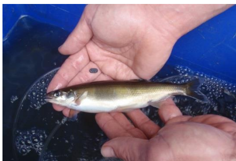
An Australian Grayling with an acoustic transmitter

In Victoria, many agencies work to implement environmental watering programs. West Gippsland Catchment Management Authority and Melbourne Water have developed seasonal watering proposals which include key flow objectives to deliver within channel flow pulses, known as 'freshes', to specifically trigger downstream migration and spawning of Australian Grayling. Every June, the Victorian Environmental Water Holder collates and summarises these seasonal watering proposals into a seasonal watering plan which previews all potential environmental watering across Victoria for the coming water year under each planning scenario.